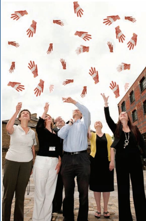
The Kirklees Warm Zone facilitation team celebrated 3 years of Free Home Insulation

Yorkshire Energy Services celebrated the success of the project with all Warm Zone partners at a promotional photo shoot on the 8 th July in St George's Quarter, Huddersfield. The Warm Zone helpline is still active for general enquiries and additional support, for more information contact 0800 052 0071.