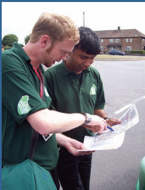
Energy Advisors hit the streets of Golcar

In each area the project is supported by the respective local authority and social housing provider with further funding from two leading utility providers.